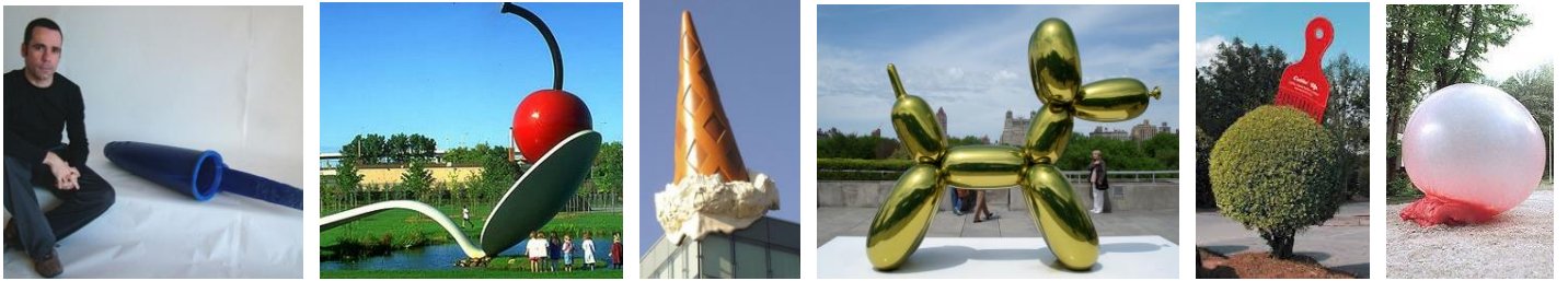
Oversized Sculpture Examples

Student Artist’s Mission – Use plaster to introduce a “boring” object in a new way.